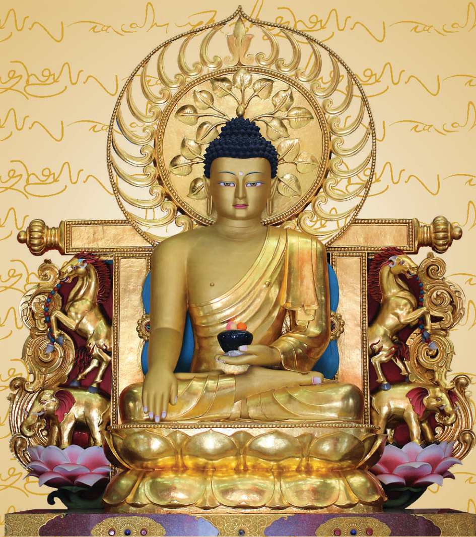
Main statue of Buddha Sakyamuni in the Great Stupa shrine room