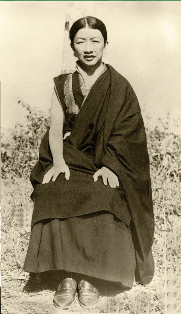
Kyabje Mindrolling Trichen Gyurme Kunzang Wangyal