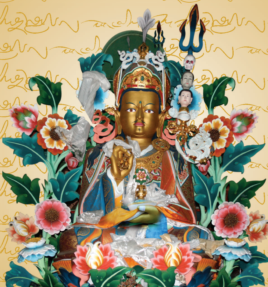
Main statue of Guru Padmasambhava in the Great Stupa shrine room